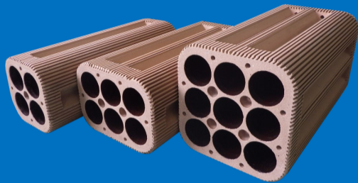
Ceramic duct for airport

Also, it has been used at Singapore, Bangladesh, and Papua New Guinea Airport.